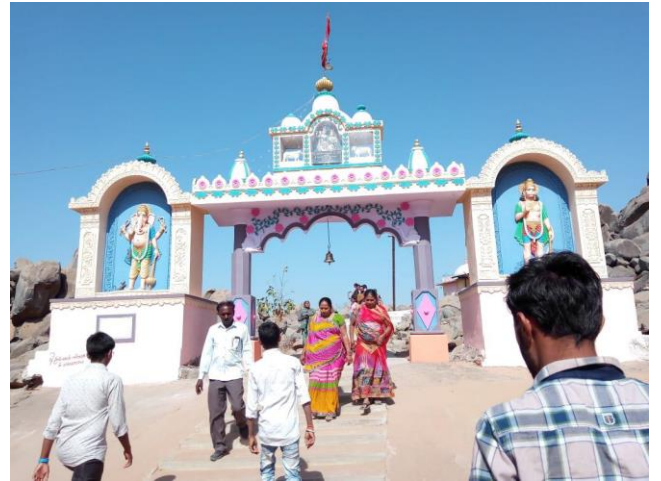
Visit of Local Places –Pewrna Pravas