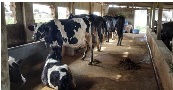
Visit of Local Dairy Farm