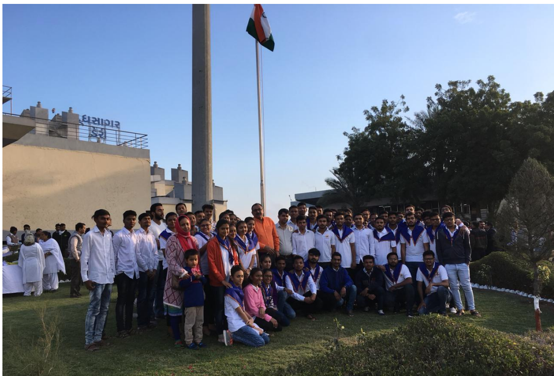
Independence Day Celebration at MIDFT, Mehsana