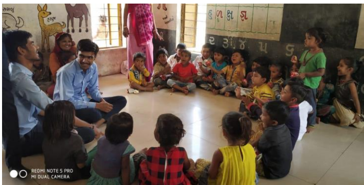
NSS Cadet with school children