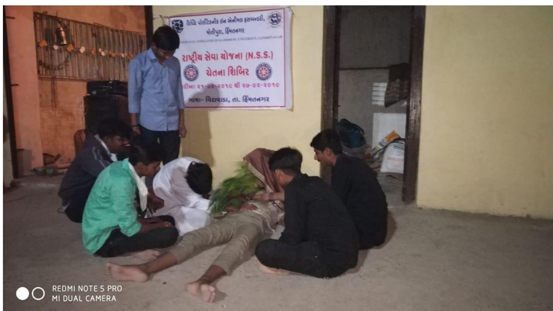
Cultural Activities at Evening Program