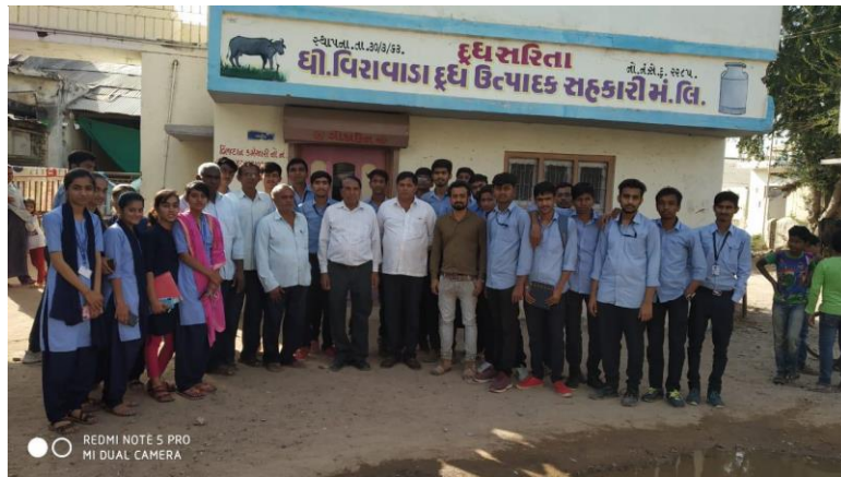
Visit of Local Milk collection center