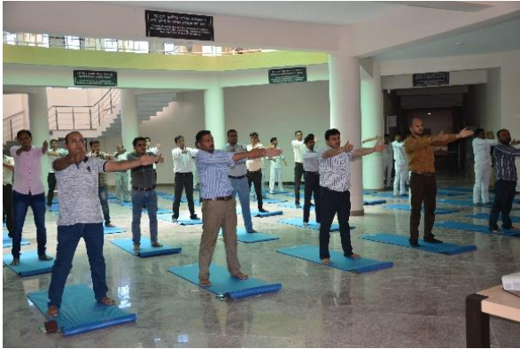
Celebration at CDS. Amreli