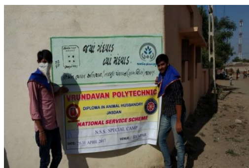
Preparation of NSS Camp