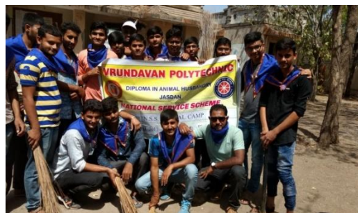
Team of NSS Camp