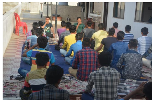
Celebration at PAH, Himmatnagar