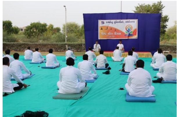
Celebration at Kamdhenu University, Gandhinagar