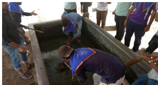
Cleaning activities during NSS Camp