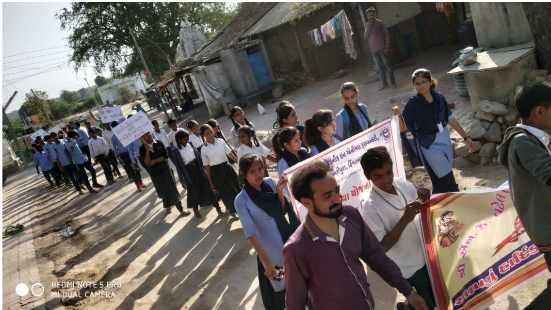
Rally for Awareness