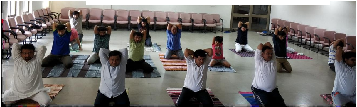
Celebration at MIDFT, Mehsana