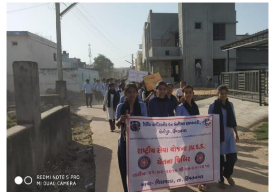
Rally for Awareness