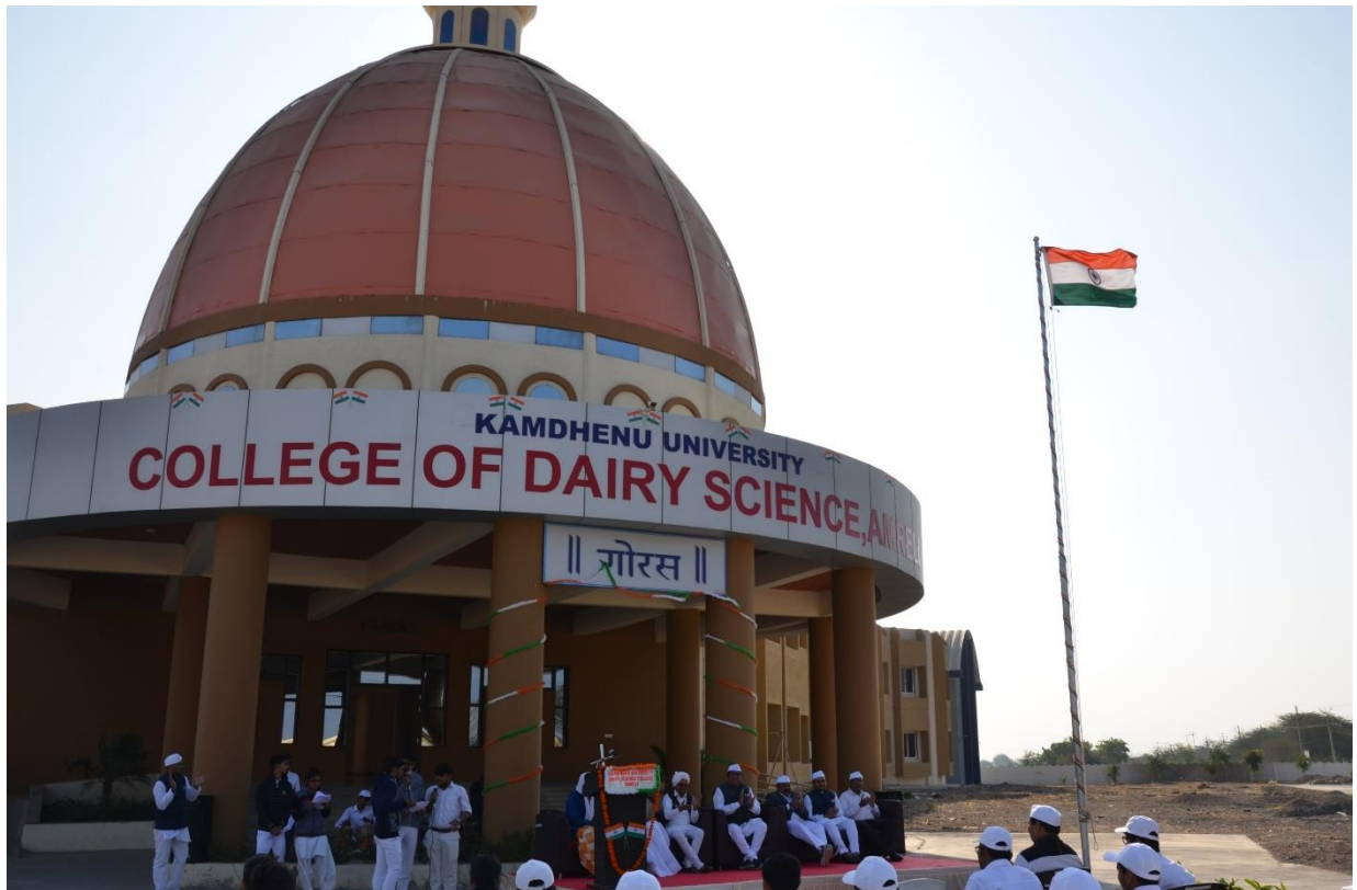
Independence Day Celebration at CDS, Amreli