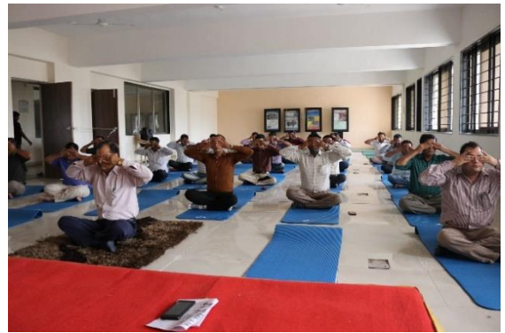
Yoga Training sessions at Kamdhenu University, Gandhinagar