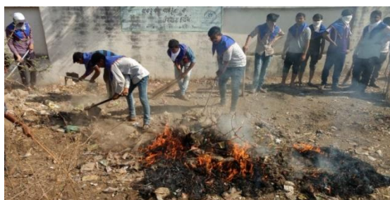
Cleaning of Panchayat Office