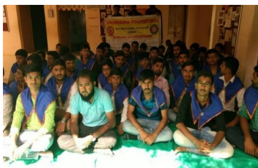
Students participated in School function

Vrundavan Polytechnic had organized a Seven day N.S.S. Special camp during 25 th -31 st May, 2017 at Village Jivapar district Rajkot. Total 25 students had participated in the special camp. During this seven days program, they had organized various activities of village improvement like "Swatch Bharat", cleaning of various place like School, Government office, Panchayat, Animal waterer, Bus station etc. The participated students had organized a cultural activities and sport activities in the school.