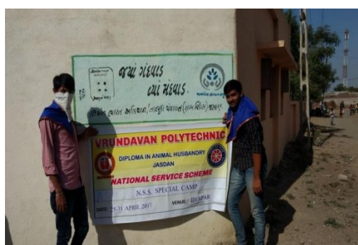
Cleaning School Premises