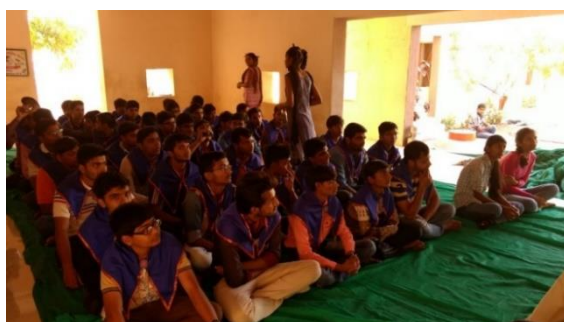
Meeting with Village farmers