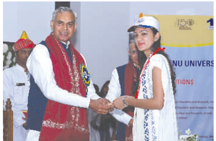
Shri Acharya Devrat, Ho'ble Chancellor and Governor of Gujarat awarding Gold Medals