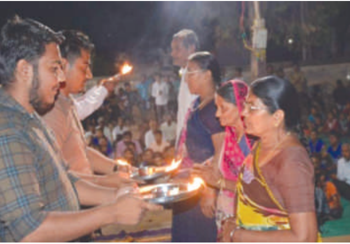
Matru Pitru Vandana