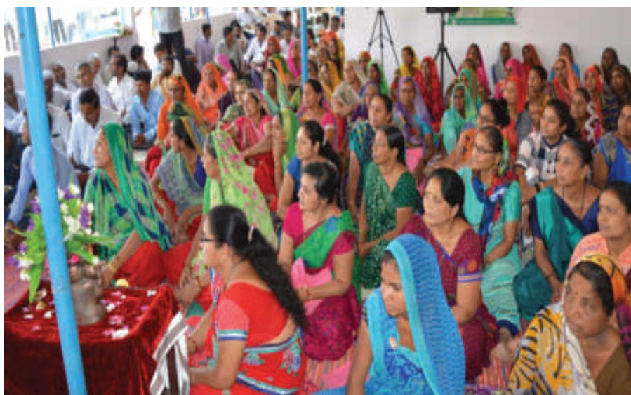
Participants at farmers training programme at Shahupura