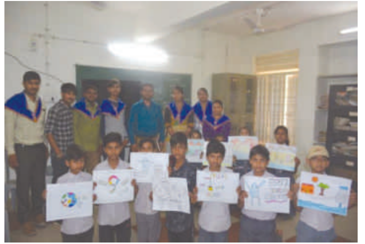
Competitions for School Students