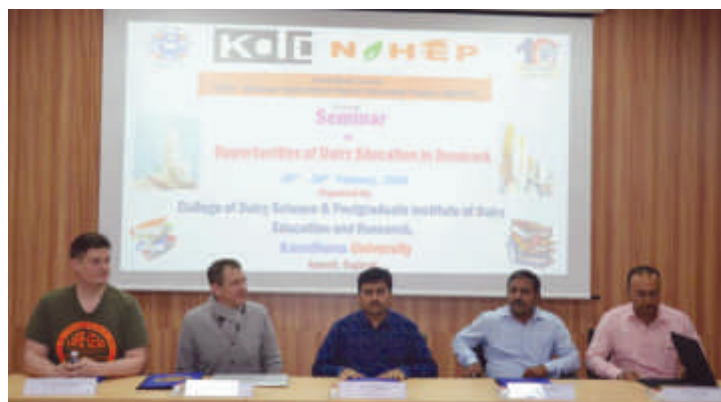
Dignitaries in Inauguration ceremony of seminar on Opportunities of Dairy Education in Denmark

The information was provided on education programme at Kold College, Denmark, research activities at Kold College, Denmark and facilities available to run the programme at Kold College, Denmark.