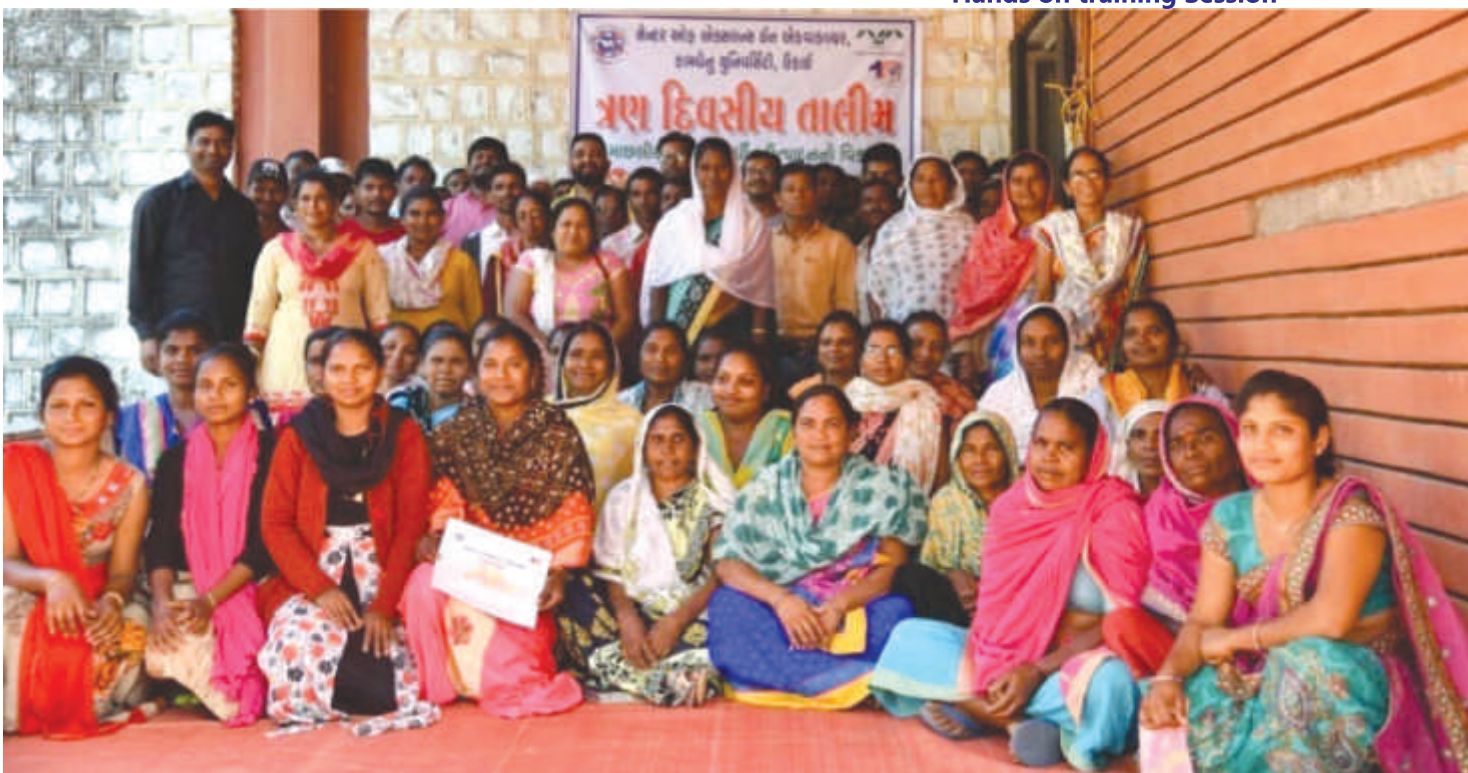
Participants of training programme on development of different value added products from fishes