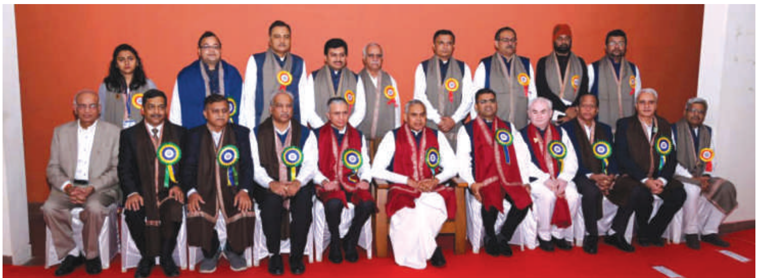
Shri Acharya Devvrat, Hon. Governorshri of Gujarat and Chancellor of Kamdhenu University with Vice Chancellor of KU and SAUs and Officers of University