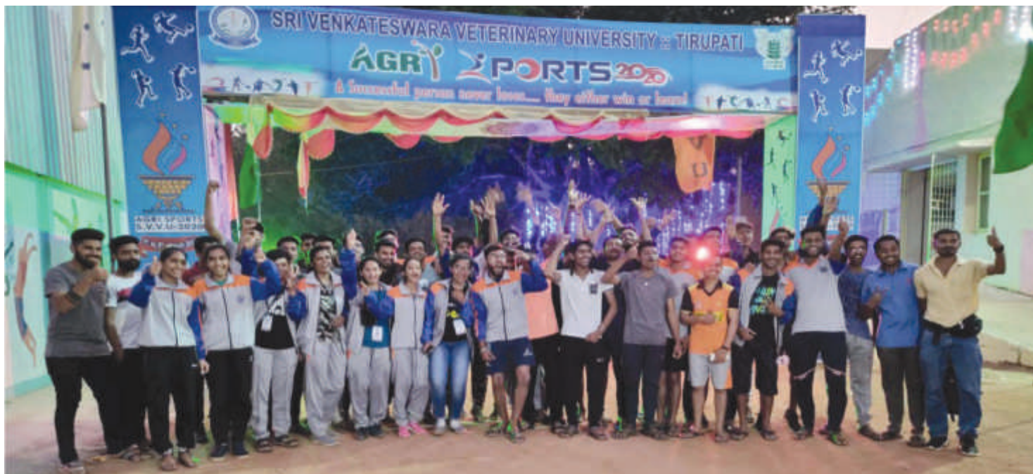
KU at Agri UniSports 2020