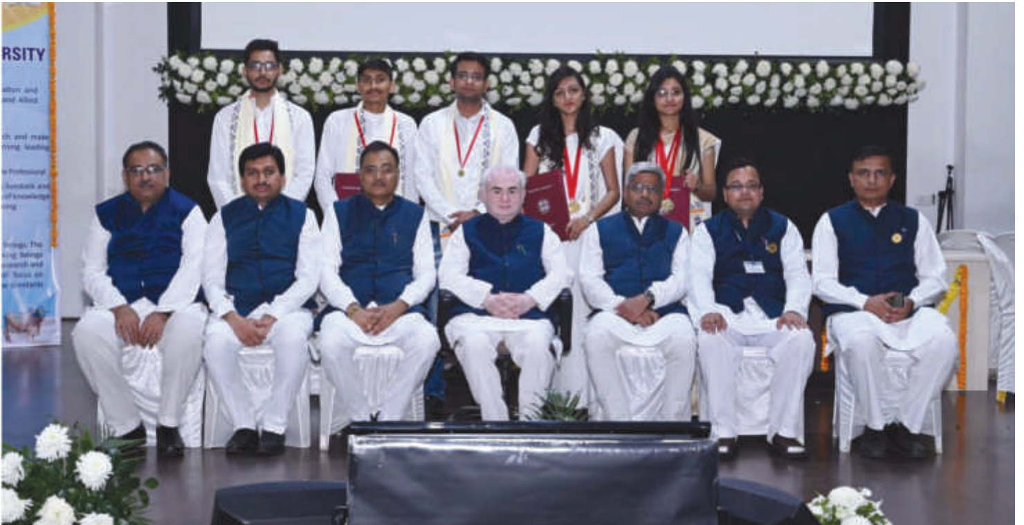
Gold medalists of Kamdhenu University with University officers at 6 th Convocation