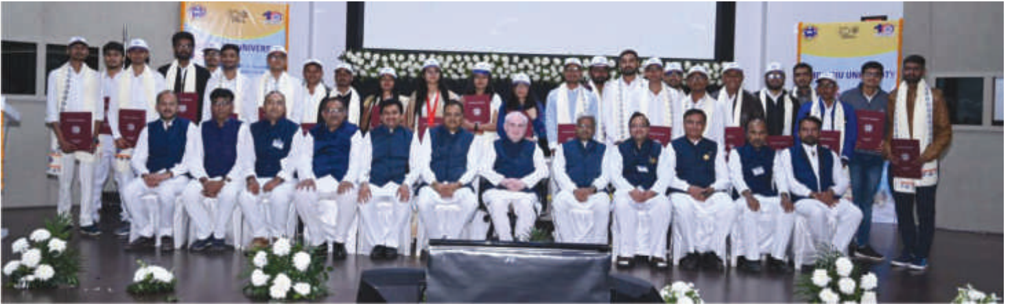
Degree recipients of Kamdhenu University with University officers and faculties at 6 th Convocation