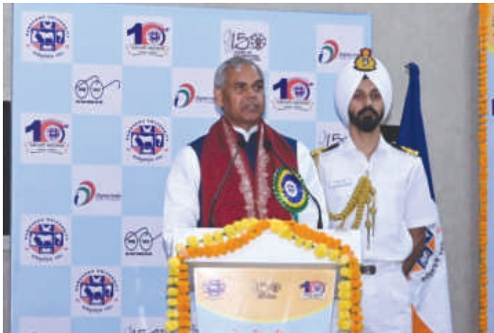
Shri Acharya Devvrat, Hon. Chancellor & Governorshri of Gujarat delivering presidential address at 6 th Convocation