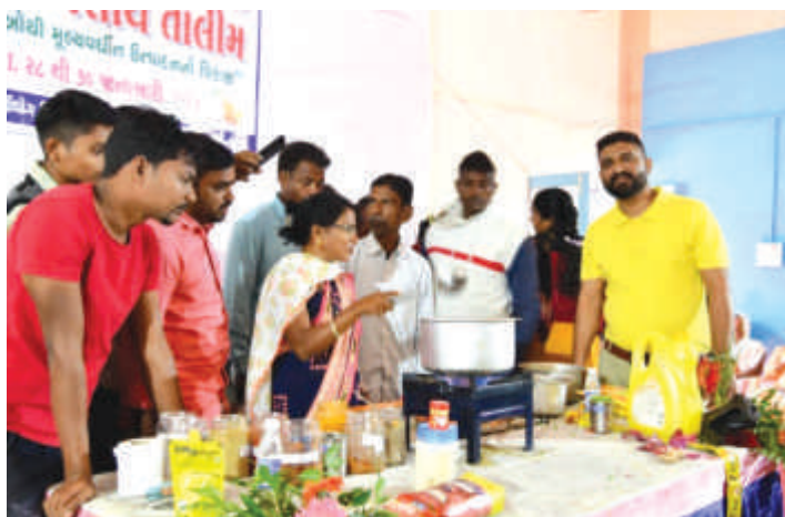
Hands on training Session