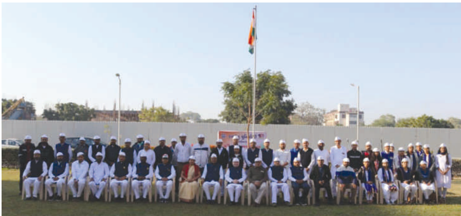
KU Family at Celebration of 71 st Republic Day