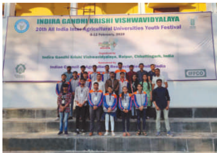
KU at Agri Unifest 2020