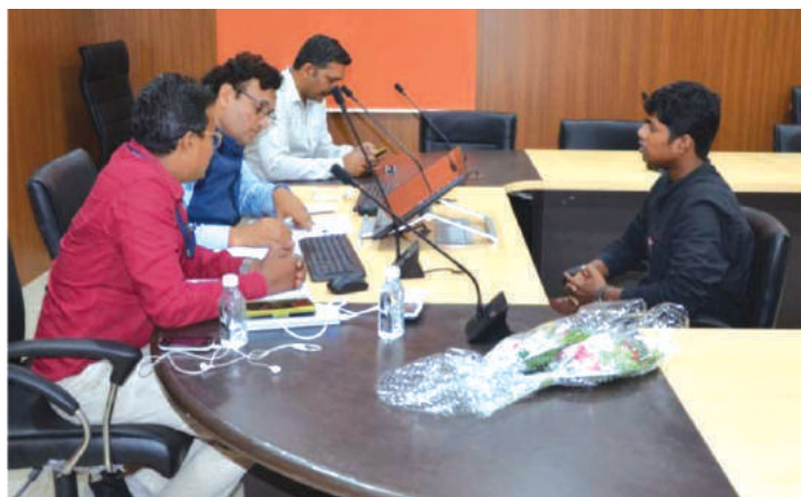
Campus interview at CDS, Amreli by Sarhad Dairy

College of Dairy Science, Kamdhenu University, Amreli arranged campus interview for final year students of B. Tech (Dairy Technology). Campus interview was conducted by Sarhad Dairy, Kutchh for on 23 rd May, 2019. Seven students were selected for the post in Sarhad Dairy.