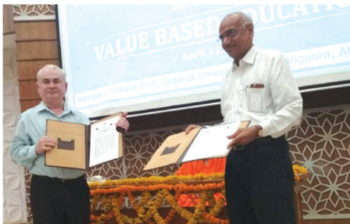
Signing MoU between KU, Gandhinagar and GFSU, Gandhinagar