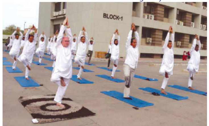
Celebration of International Yoga Day