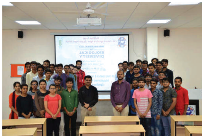
Celebration of International Day for Biological Diversity at CDS, Amreli

The International Day for Biological Diversity is observed on 22 nd May every year. College of Dairy Science and Postgraduate Institute of Dairy Education and Research, Kamdhenu University, Amreli has celebrated the same under the NAHEP project on 22 nd May, 2019.