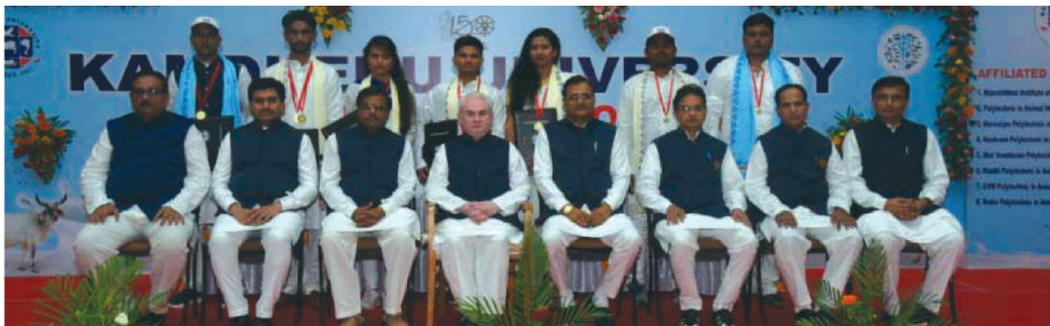
Gold medalists of Kamdhenu University at 5 th Convocation

Fourth Annual Report (2017-18) of Kamdhenu University was also released by Hon. Governorshri O. P. Kohli and other dignitaries.