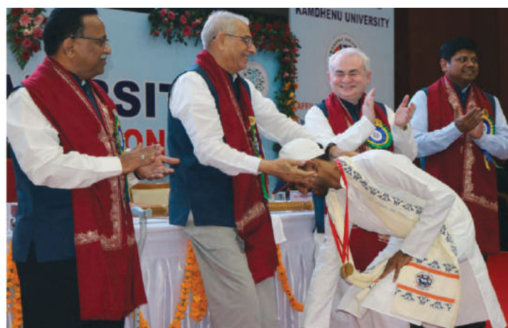
Hon. Goversnorshri O. P. Kohli awarding gold medals