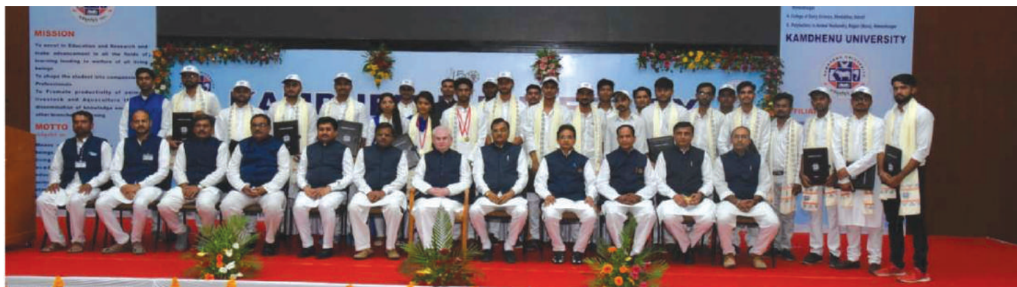
Degree recipients of Kamdhenu University at 5 th Convocation