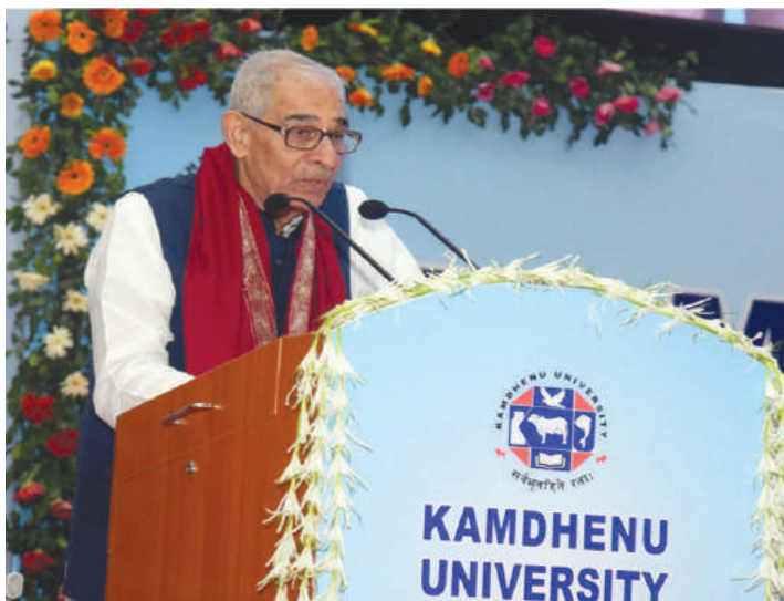
Shri O. P. Kohli, Hon'ble Chancellor & Governor Shri of Gujarat delivering presidential address at 5 th Convocation