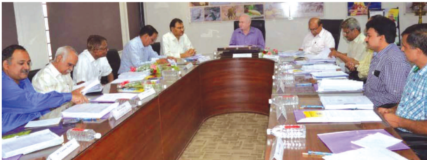
13 th Meeting of Academic Council

In this meeting members of council approved the academic programmes as well as academic calendar for the Academic Year 2019-20.