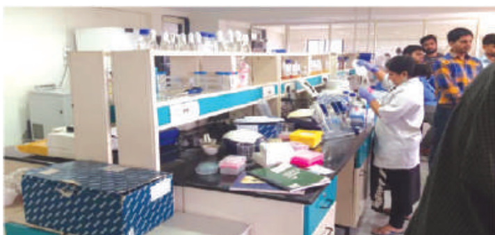
Demonstration of various protocols of molecular biotechnology to participants