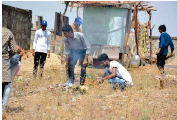
Cleanliness and Ground Leveling Campaign at PAH, Rajpur (Nava)