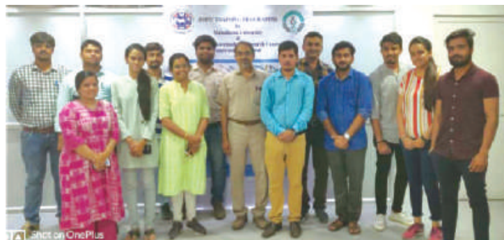
Participants of Hands on Training on Basic Molecular Techniques