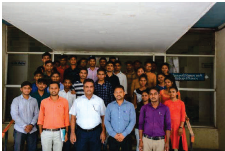
Celebration of World Milk Day at PAH, Rajpur (Nava)