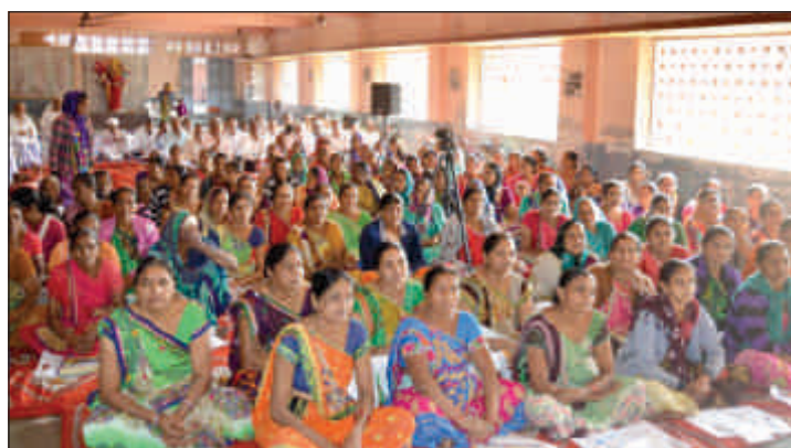
Participants of Animal Husbandry Training Programme, Juna Untarada, Ta. Dehgam