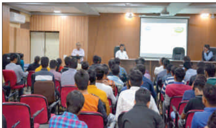
Celebration of National Agricultural Education Day at PAH, Rajpur (Nava)