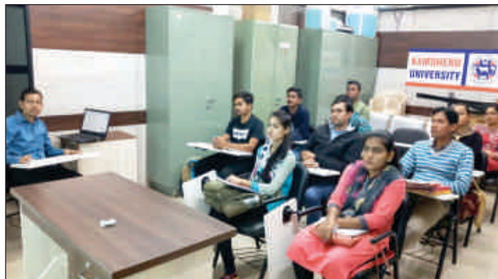
Students and faculty of KU at hand-on cum demonstration session on 'tracing information from reference sources'