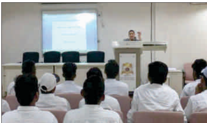
Celebration of National Agricultural Education Day at MIDFT, Mehsana

Agricultural Minister in 1946 and First President of Independent India. On this occasion, Principal and faculties of respective institute delivered lectures on importance of education in agriculture and animal husbandry, government policy regarding enhancing the agricultural education and importance of celebration of this day.