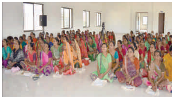
Dairy farm women attending training programme at Dhamasana, Ta. Kalol, Dist. Gandhinagar