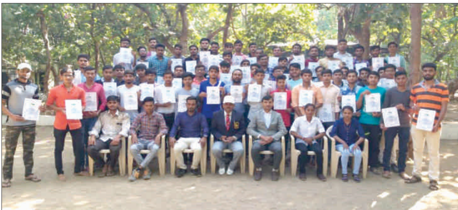
Students of CDS, Amreli at Basic Rock Climbing Camp

learnt the theory and art of climbing, which make them realize rock as a living friend so they feel safe while they climb, cooking in a jungle, picking delicious fruits, sentry duty at night, learning and developing ecofriendly behavior to conserve our precious jungles and mountains. They all get unforgettable experience of life from training.