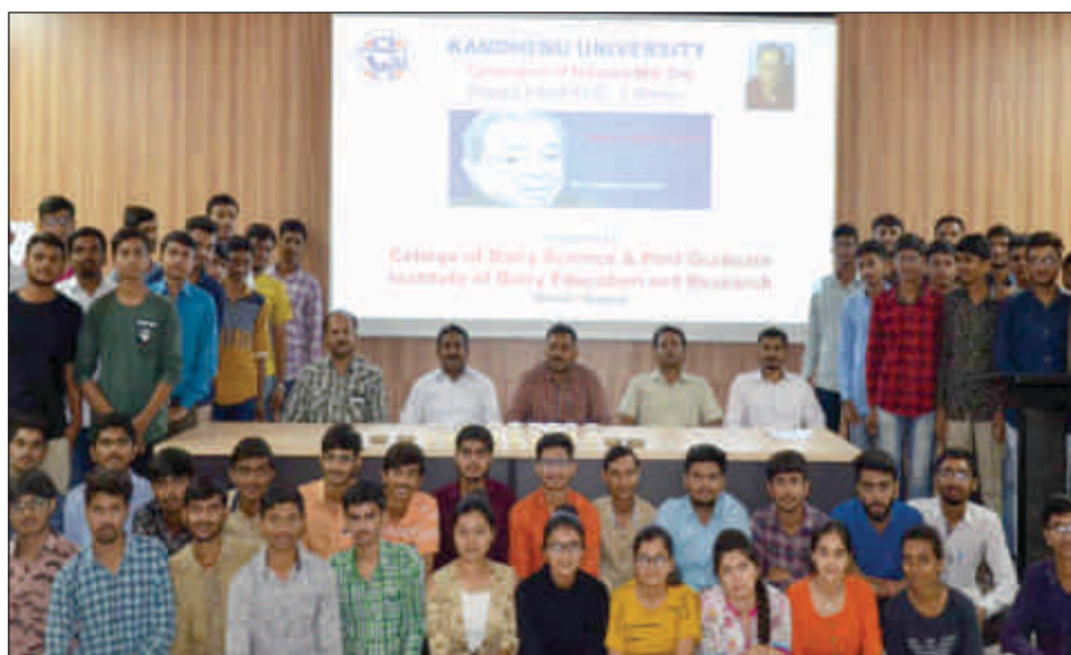
Celebration of National Milk Day

College of Dairy Science and Post Graduate Institute of Dairy Education and Research, Amreli has celebrated National Milk Day on 26 th November, 2018 at Shedubhar, Amreli to pay tribute to Dr. Varghese Kurien, the father of white revolution in India.