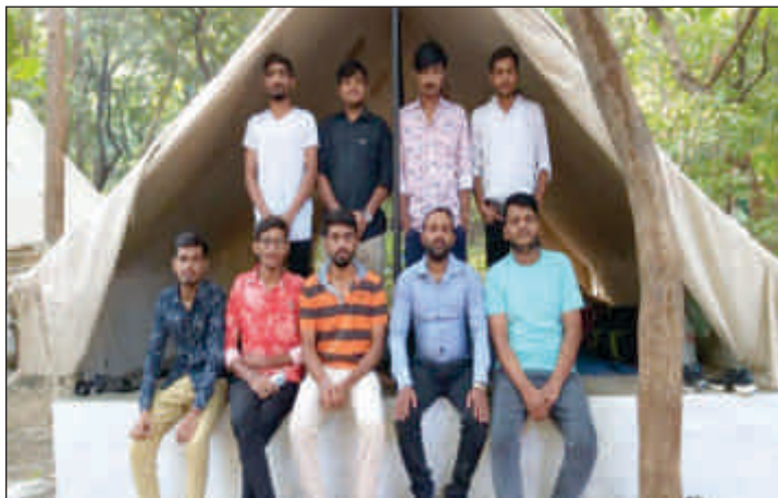
Students of CDS, Amreli at Basic Rock Climbing Camp