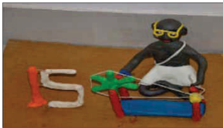
Clay Models prepared by Students of KU in SARJAN