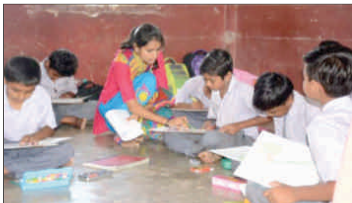
Glimpses of NSS Special Camp at Rajpur (Nava)