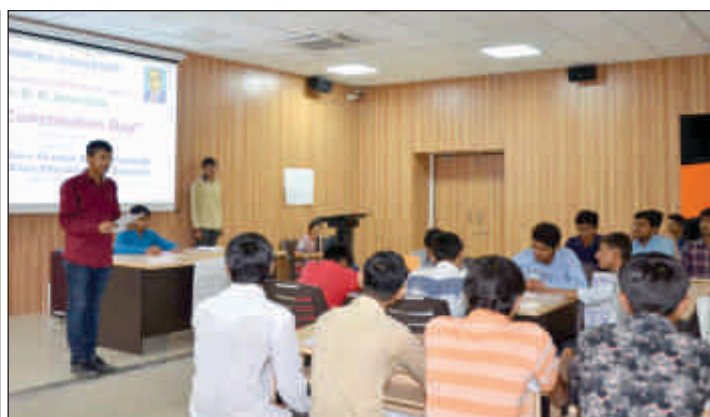
Celebration of Constitution Day