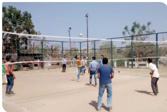
Students of PAH, Himmatnagar at Inter-Semester Sports Competition

The students of Polytechnic in Animal Husbandry, Kamdhenu University, Himmatnagar were awarded with General Champion Trophy, 4 Gold and 5 Silver Medals in an Inter Collegiate Sports Competition-SPANDAN 2016.