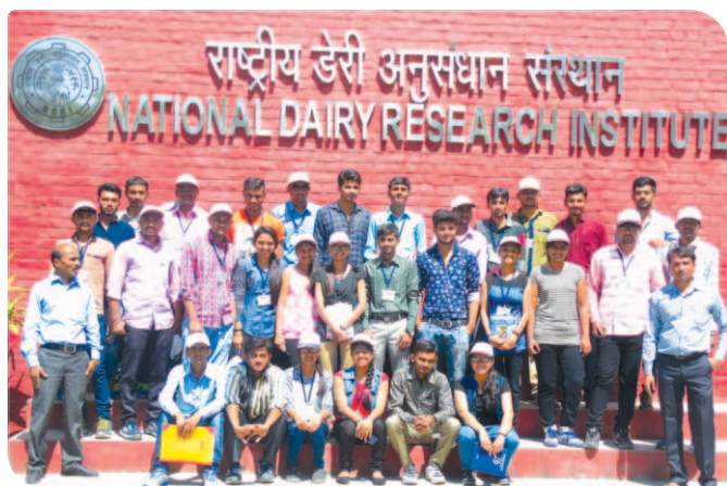
NDRI, Karnal visit during Educational Tour

College of Dairy Science, Amreli organized an educational tour to North India for the final year B.Tech (DT) students from March 20, 2016 to April 10, 2016.