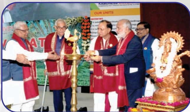
Lighting of Lamp by Dignitaries

During the Convocation, 32 final year students of College of Dairy Science, Amreli and 25 students of Mansinhbhai Institute of Dairy and Food Technology (MIDFT), Mehsana were awarded B.Tech. (Dairy Technology) degree. Also, 30 students of Polytechnic in Animal Husbandry, Himmatnagar were awarded Diploma in V.Sc. & AH. The Vice Chancellor's Gold Medals