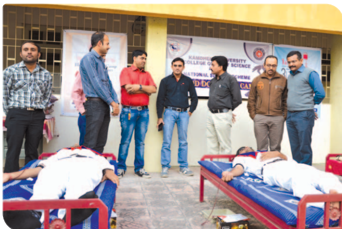
Blood Donation Camp at CDS, Amreli

College of Dairy Science organised a Blood Donation Camp at the College campus on December 19, 2015. Students and staff enthusiastically participated for this noble cause.