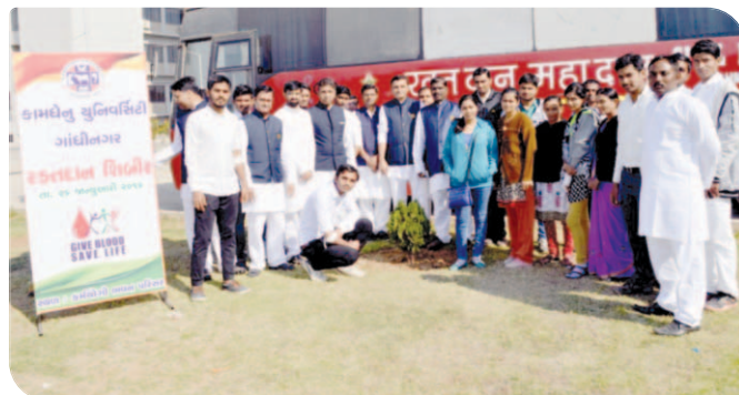
Staff and students of KU alongwith staff of Civil Hospital, Ahmedabad at the blood donation camp.

On the eve of Republic Day Celebration, Blood Donation camp in collaboration with Civil Hospital, Ahmedabad was organized for the welfare of society. All the staff and students were actively involved in noble cause.