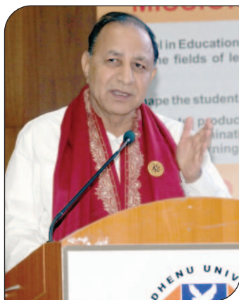
Hon'ble Agriculture Minister Shri Babubhai Bokhiria addressing the gathering