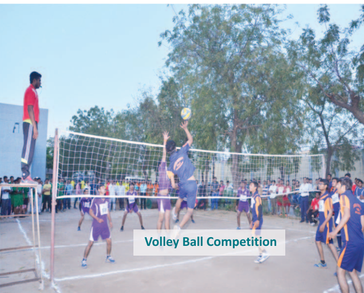
Volley Ball Competition