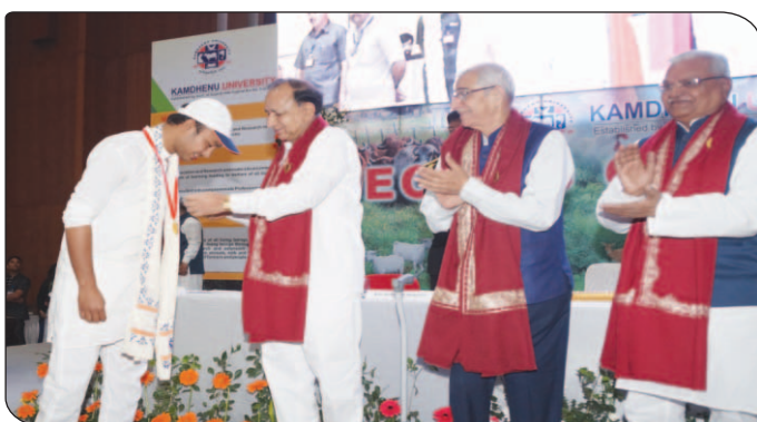
Students receiving Gold Medals from Dignitaries