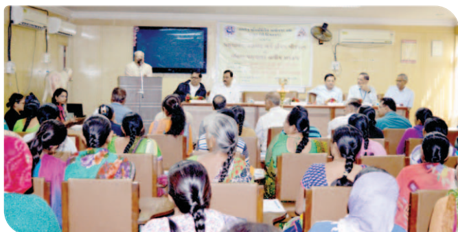
Hon'ble Vice Chancellor, KU delivering Presidential address at the training programme