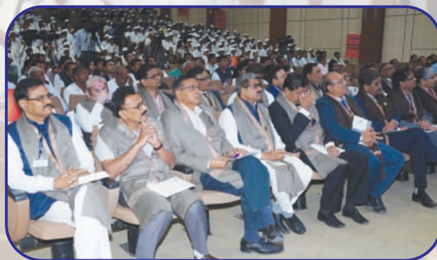
Hon'ble Vice Chancellors of SAUs of Gujarat, Members of Planning Board, University Officers and August Gathering