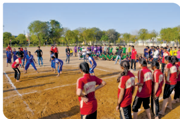
Kabbaddi Competition between Girls of MIDFT, Mehsana and CDS, Amreli