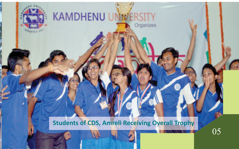
Students of CDS, Amreli Receiving Overall Trophy