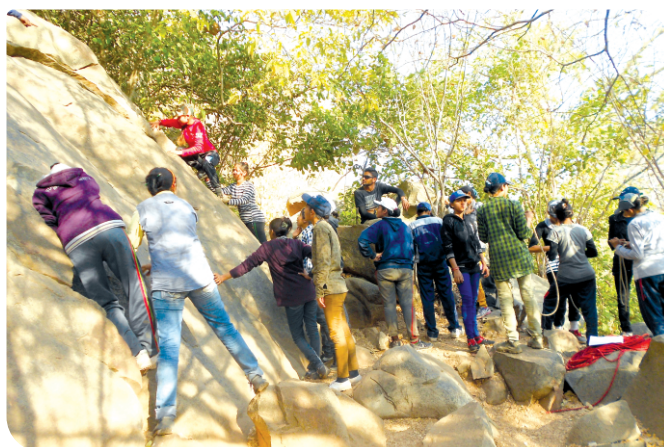
Training of Mount Climbing