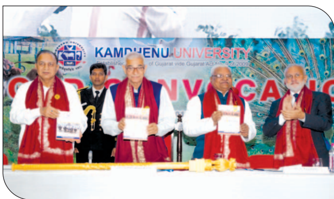
Hon'ble Governor and dignitaries releasing Annual Report-2014-15