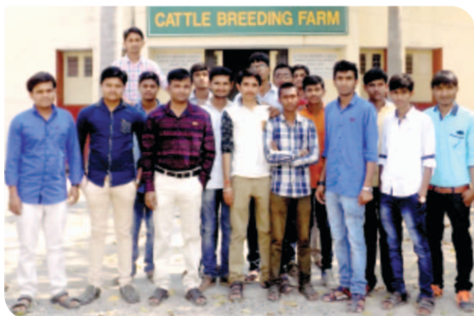
Students of PAH, Himmatnagar at Cattle Breeding Farm, Junagadh