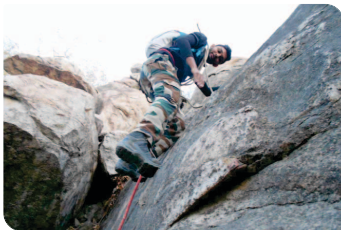
Student of CDS, Amreli at the Mountaineering Camp