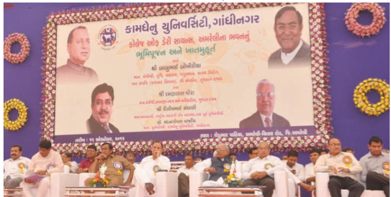
Dignitaries on the Dias at Bhoomipujan and Khatmuhurat of Proposed Building of College of Dairy Science, Amreli