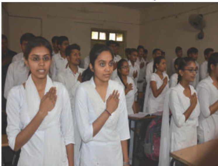
Students of College of Dairy Science, Amreli taking the oath of non-violence on International Non-violence Day on October 02, 2015

International Non-violence Day was celebrated at College of Dairy Science, Amreli on Mahatma Gandhi Jayanti on October 02, 2015. Students of the college took an oath of non-violence on this day and remembered Mahatma Gandhi for his supreme contribution made for the Indian Independence through non-violence.