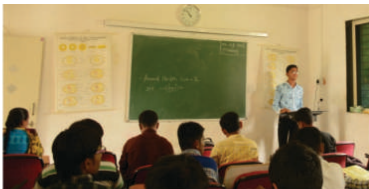
A student enacting a Teacher on Teachers' Day celebration at Polytechnic in AH, Himmatnagar