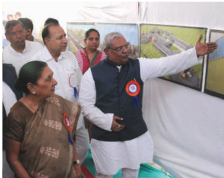
Prof. Varshneya, Hon'ble Vice Chancellor of KU explaining the plan of proposed building of Polytechnic to Hon'ble CM, Smt. Anandiben Patel and Hon. Minister of Agriculture, Shri Babubhai Bokhiria