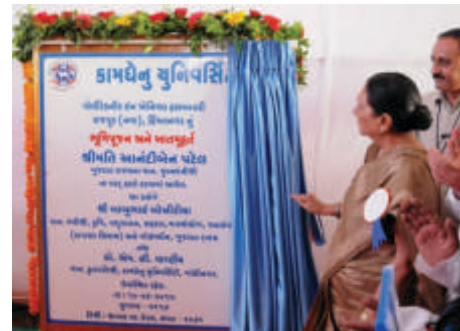
Hon'ble Chief Minister, Smt. Anandiben Patel, unveiling the inscription stone of proposed building of Polytechnic in AH, KU at Rajpur (nava), Himmatnagar