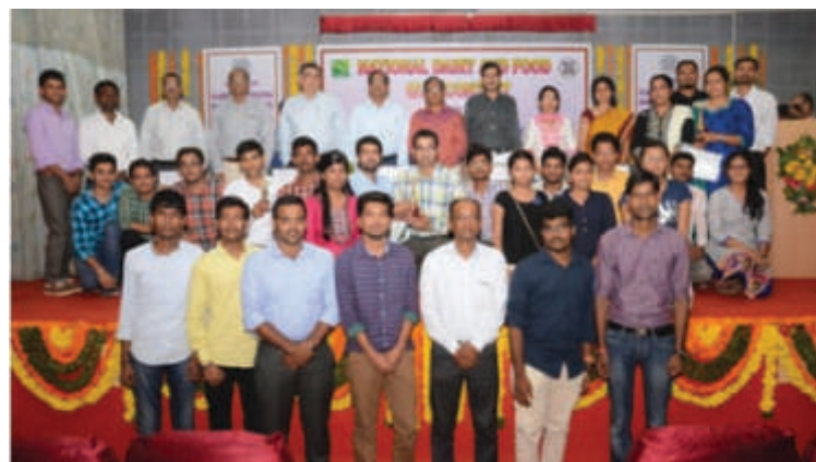
Faculty and students at National Dairy Products Judging contest organised by AAU, Anand