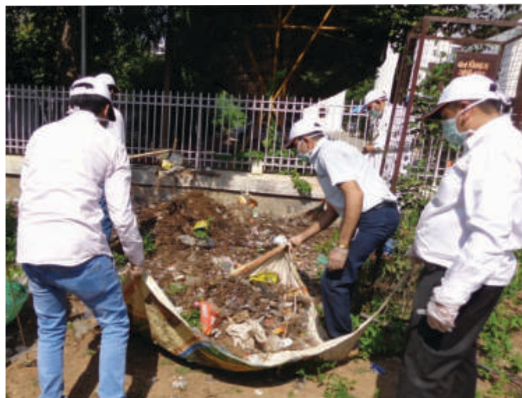
Students and staff of KU removing debris during the cleanliness drive.