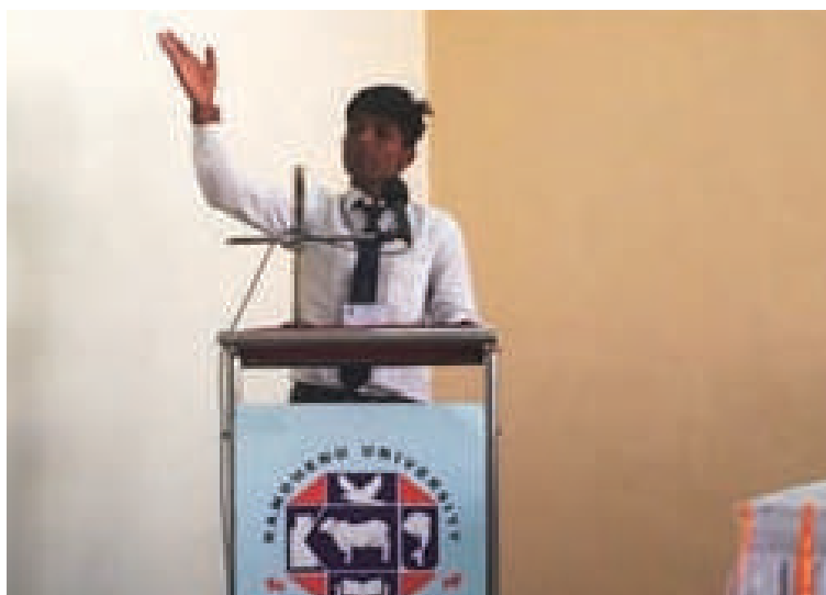
Participant student at inter college/polytechnic elocution competition