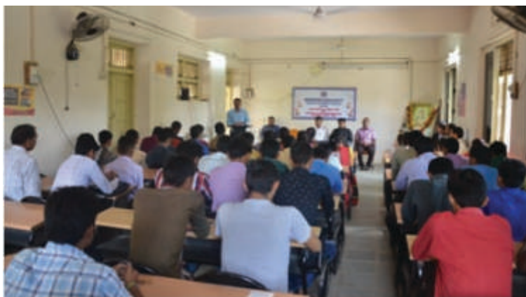
Newly admitted students at the orientation programme