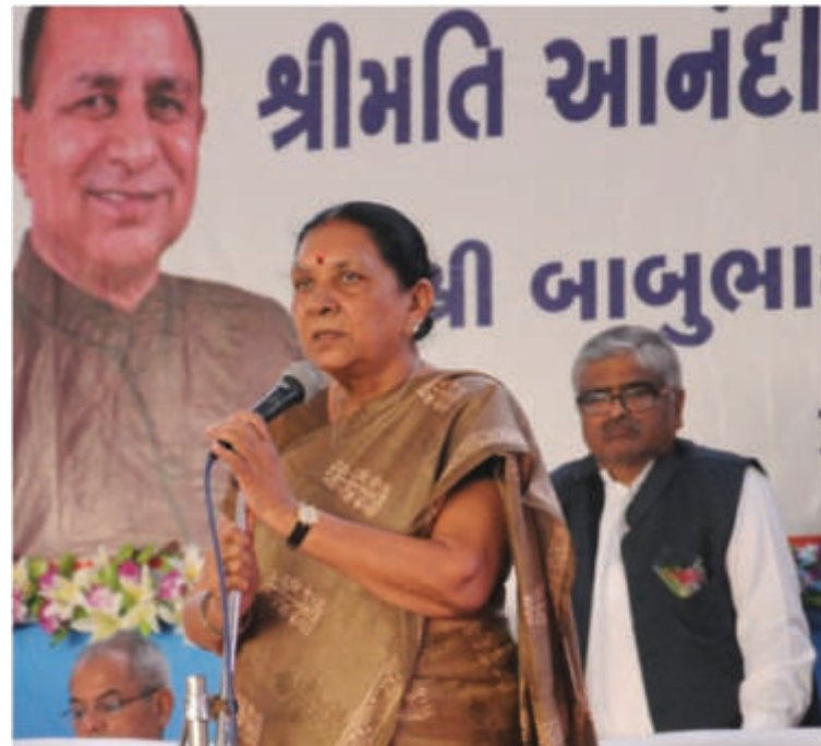
Hon'ble Chief Minister Smt. Anandiben Patel addressing the audience at Bhoomipujan of proposed polytechnic in AH, Himmatnagar