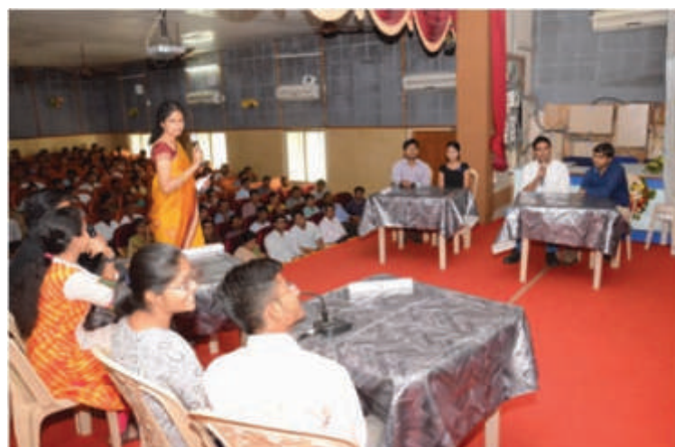
Students in a quiz contest at National Dairy Products Judging contest organised by AAU, Anand