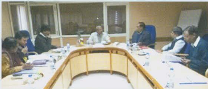
First Board of Management meeting in progress