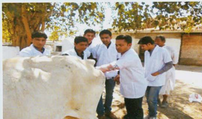
Clinical Camp at Himmatnagar