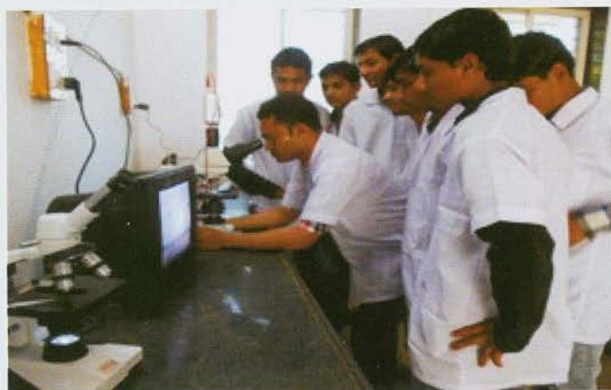
Practical Laboratory at Polytechnic, Himmatnagar

Polytechnic at Himmatnagar has adequate facilities for Teaching and Practicals. Students are also exposed to clinical camps for first hand exposure.