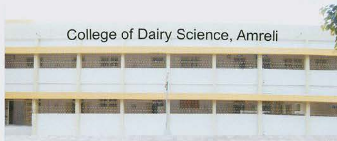
College of Dairy Science, Amreli