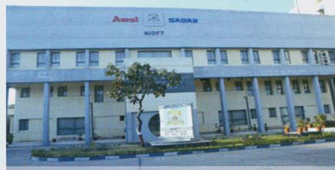
Mansinhbhai Institute of Dairy & Food Technology Dudhsagar Dairy Campus, Mehsana.