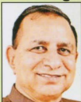
Shri Babubhai Bokhiria

Hon. Minister for Agriculture & Co-Operation, Animal Husbandry, Fisheries & Cow-breeding. Govt. of Gujarat.