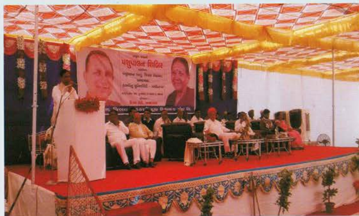
Pashu Palan Shibir at Bhamsara on Jan 19, 2015