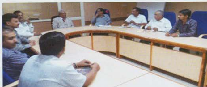
First Staff meeting of KU.