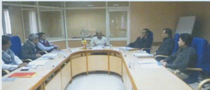
First Academic Council meeting in progress