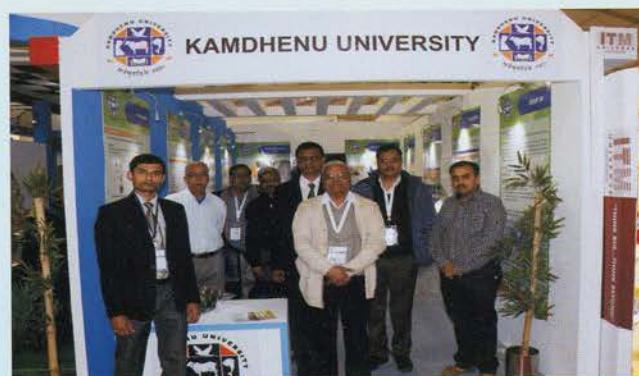
KU stall at Vibrant Gujarat Summit

KU participated in Vibrant Gujarat Summit 2015 organised by the Government of Gujarat between Jan 7-13, 2015 at Gandhinagar. A pavilion on the theme of Education was center of attraction for the students where KU had a stall in which activities of University were depicted.