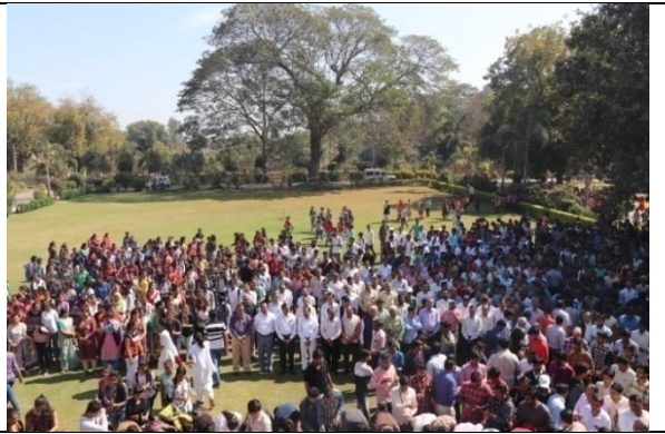
Candle March- 2019