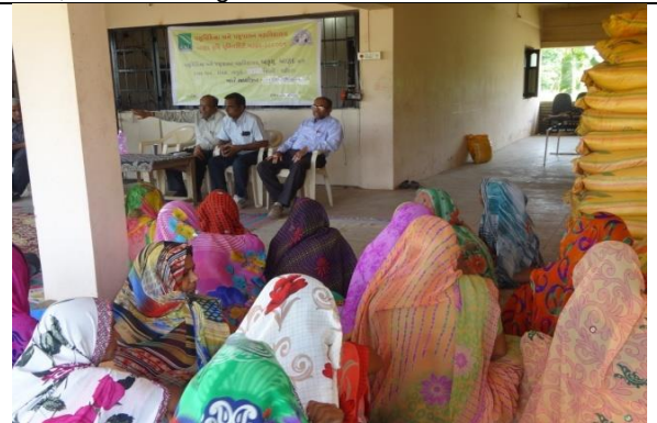
Farmers Training camp organized by College of Veterinary Science, AAU Anand at Rayka Village on 02.09.2015