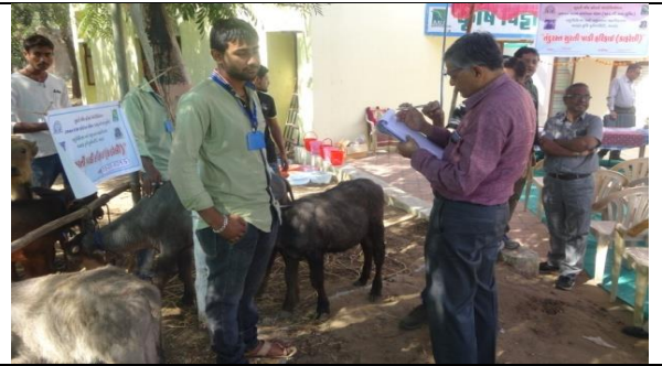
Participated in Surti Calf rally on 24.02.2016 at KVK Devataj