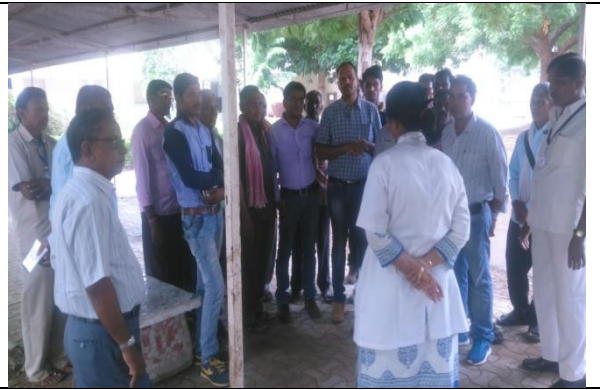
Our Visitors: Progressive Farmers of Chhattisgarh FIG of ATMA