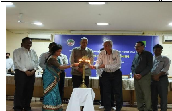
Participation in Youth Election Awareness seminar-2019