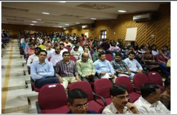
Participation in Youth Election Awareness seminar-2019