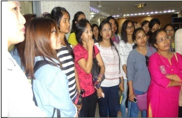
Our Visitors: Students of Veterinary College Khanapura, Guwahati, Assam