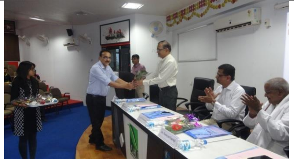
Leadership and Entrepreneurship Development Training Programme by NCCSD at College of Veterinary Science, AAU, Anand during 23/24.02.2016