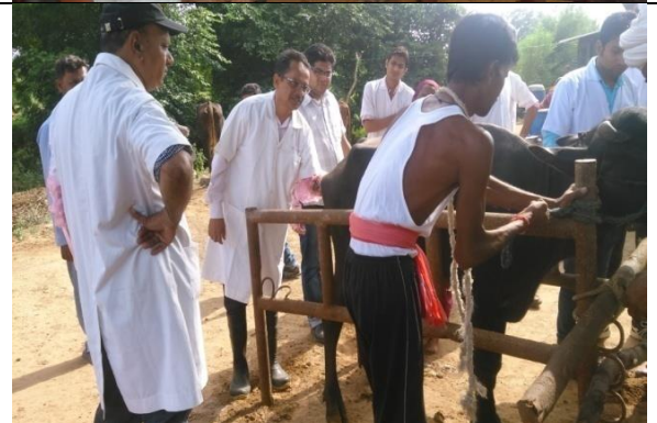
Animal Health Camps organized by College of Veterinary Science, AAU Anand at Rayka Village on 03.09.2015