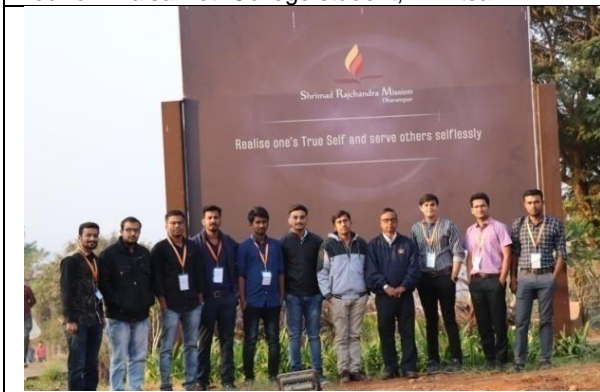
Participation in Mega Camp at Dharampur – 2018