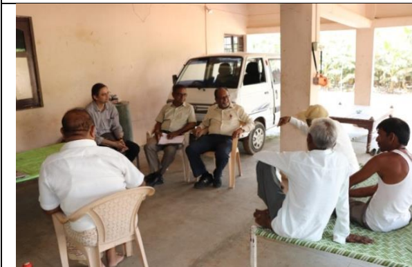
Participation in MGMG programme