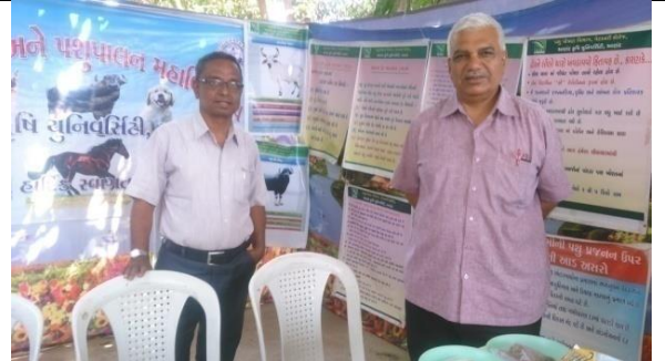
Exhibition arranged at Gorva village Ta Borsad in Pashu Palan Shibir on 18.03.2016