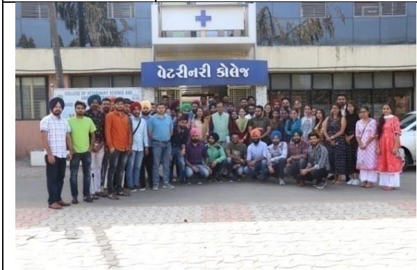
Tour of Khalsa Vet. College student, Amritsar