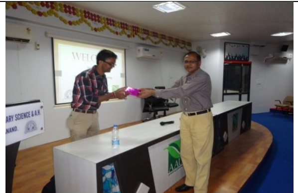
Workshop on "Teaching Efficiency: Cultivating Communication Skills" at College of Veterinary Science, AAU, Anand during 26.08.2015